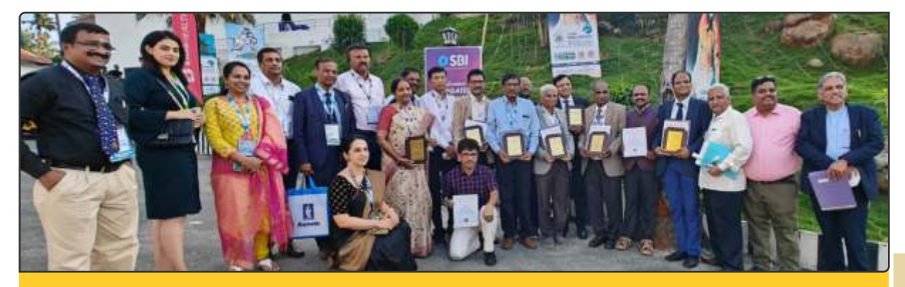
IMA National Conference at Thiruvanantapuram - Team of Karnataka